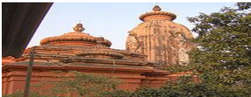
Chapaleswar (Shiva) temple, Karnagarh

The historical landmarks include at 1851, the Jagannath Temple at Nutan Bazar was constructed, presumably at the behest of an Odisha Ganga royal descendent. The Hanuman-jeu Temple in Mirzabazar, the Sitala Temple in Barabazar, and the Habibpur Kali Temple are further temples from the eighteenth century.[3] The Rukmini temple at Nutanbazar, which was established in the 17th century, is one of the town's older temples. A temple belonging to the Ramakrishna Mission is situated next to a primary and secondary school. Although it is a more recent addition, the goddess Kali at the Battala temple is a significant temple in the area.