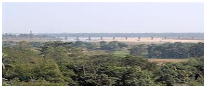
A view of the Kasai from Gopegarh Heritage Park