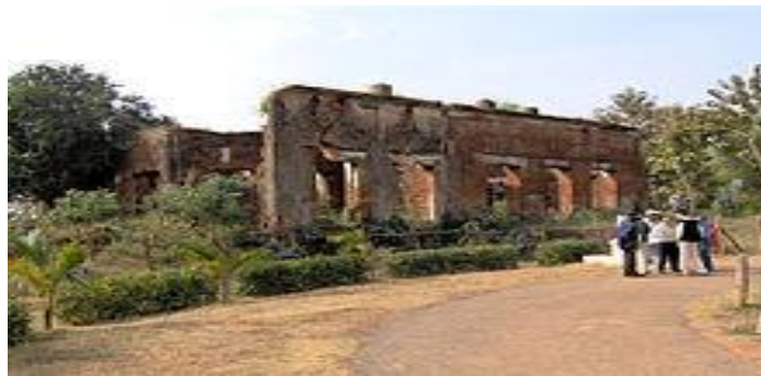
The royal ruins at Gopegarh Heritage Park

Midnapore rose to prominence as a significant Brahma Samaj hub during its heyday. As the headmaster of the Zilla School, Rishi Rajnarayan Basu served as one of the leaders of the Brahma Samaj movement. A quiet trace of the Brahma presence in the past may be seen in the decrepit Brahma Samaj "Brahma Samaj Mandir" building outside Midnapore Collegiate School. Some of the more than 150-year-old administrative and educational structures are still in use today.